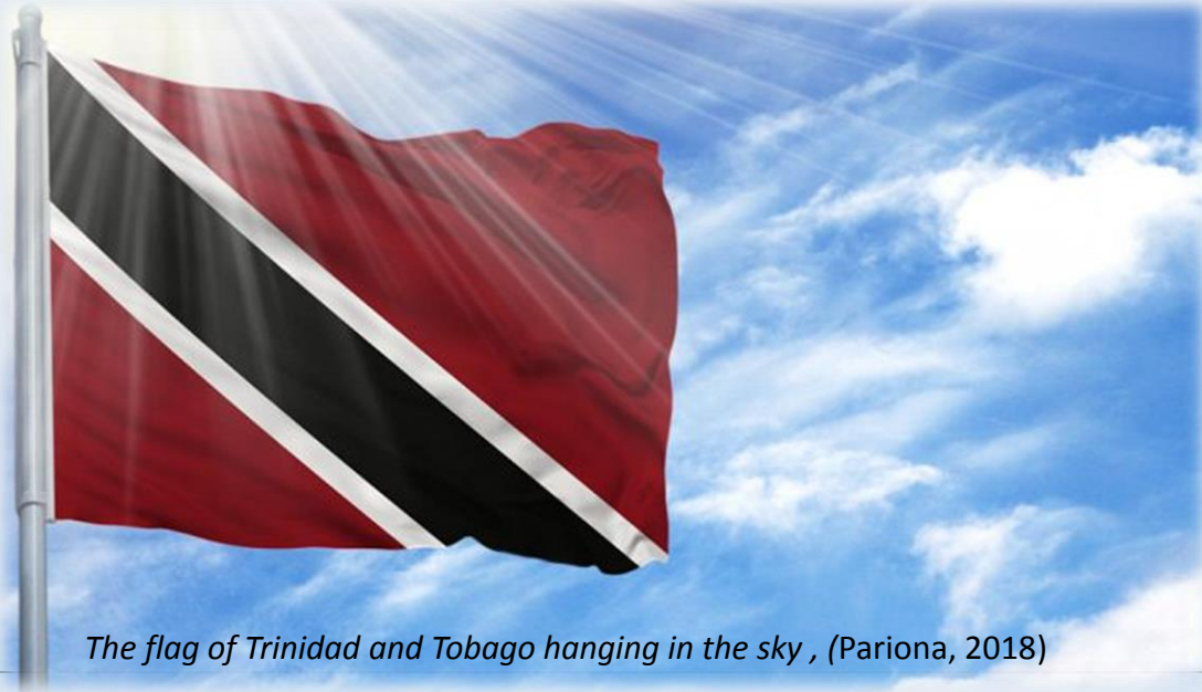
The flag of Trinidad and Tobago hanging in the sky , (Pariona, 2018)